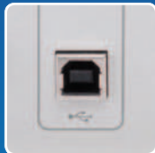
Data exchange via USB interface

By means of extremely short flash impulses the HELIO-STROB master allows the observation of very rapid processes with the naked eye. It provides pin sharp images of the apparently stationary object: the "stroboscopic effect". All functional adjustments can comfortably be set via the touch panel and the twist knob. When analysing fast processes such as rotation or vibration the standard features "slow motion" and "position" (phase shifting) put even the smallest detail into perspective. The finely graduated dimmer function allows an adjustment of the light intensity and thus enables fatigue-free observation to the smallest detail. The flash frequency can either be controlled by the accurate internal trigger, by an external trigger or even by mains synchronous triggering. Thanks to the integrated prescaler external impulses are processed up to a frequency of 8000 Hz*.