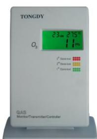
with desktop bracket