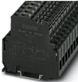
Electronic circuit breaker, 1 reset input, nominal current: 12 A

Please be informed that the data shown in this PDF Document is generated from our Online Catalog. Please find the complete data in the user's documentation. Our General Terms of Use for Downloads are valid ( http://download.phoenixcontact.com )